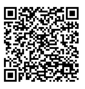
Download Submission Form

Send in your filled in abstract submission form until March 30th 2023. We are looking forward to your contributions!